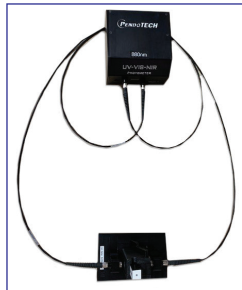
Test Rig Connection to Photometer