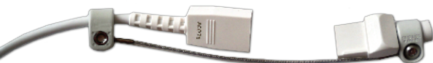
It comes with a tether so it remains attached to the cable when not in use