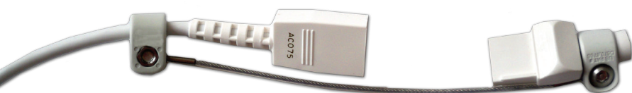
It comes with a tether so it remains attached to the cable when not in use