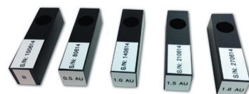
Set of Cuvette Standards

To use the test rig, fiber optic cables supplied with the PendoTECH SPEC L and P photometers are attached to the photometer and to the cuvette holder, in both cases thru the standard SMA 905 fittings. The cuvette/filters are placed in the cuvette holder and held securely in place with a band clamping device that gently applies pressure to ensure consistent positioning. Starting with the blank cuvette (no filter, 0 absorbance) which is tared to 0 AU, the remaining filters are inserted in the holder. The output from the photometer is recorded for each filter and compared to the value of the filter measured on the qualified spectrometer. In addition to the blank cuvette, standards of the following approximate values are supplied, all in AU: 0.5, 1.0, 1.6, and 2.0.