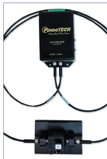
Test Rig Connection to Photometer