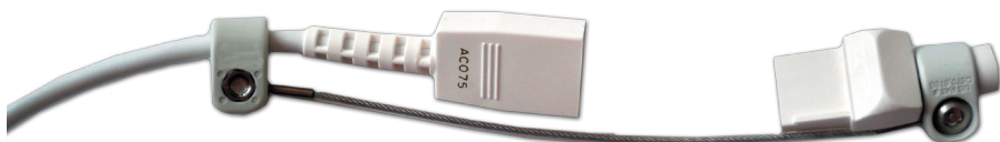
It comes with a tether so it remains attached to the cable when not in use